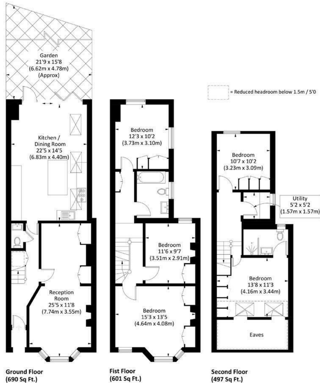
Illustration for identification purposes only, measurements are approximate, not to scale. FloorplansUsketch.com © 2020 (ID616165)

DISCLAIMER •These particulars are intended to give a fair and substantially correct overall description for the guidance of intending purchasers and do not constitute an offer or part of a contract. Prospective purchasers and/or lessees ought to seek their own professional advice.